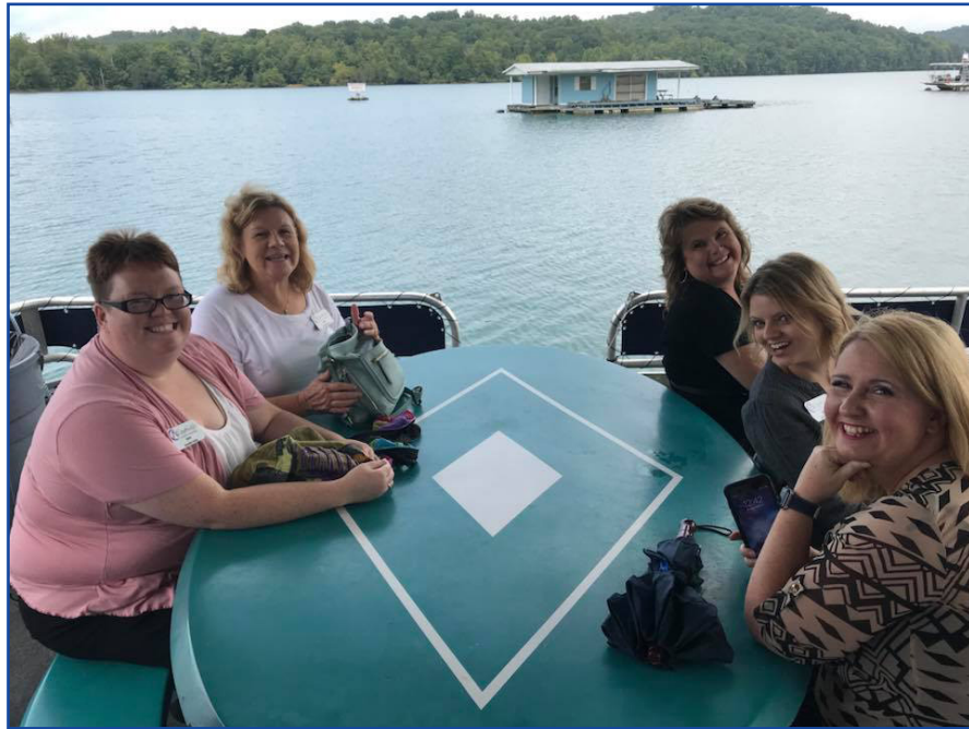
LAC Participants enjoy an afternoon ride on one of Sequoyah Marina's houseboats.