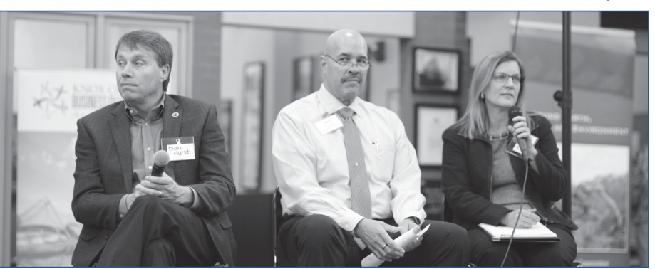
East TN Business Growth Conference panel.