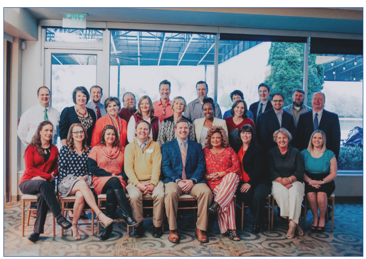
The Leadership Anderson County Class of 2018

The Chamber would like to congratulate both Leadership classes on their completion of the program and are looking forward to starting the Leadership Class of 2019 program!