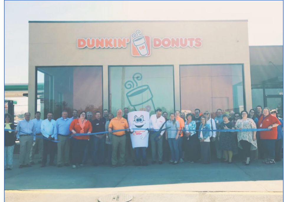
Dunkin' Donuts celebrated their new Clinton location with a Ribbon Cutting on Friday, April 13.