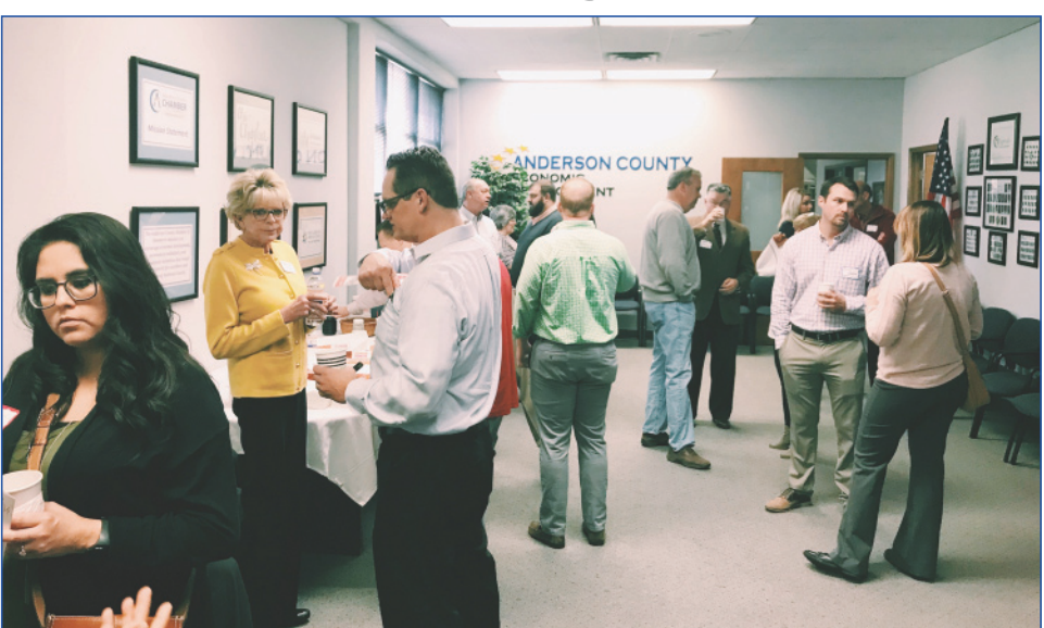
A2Z Nannies hosted a Networking Coffee at the Chamber on April 19, 2018