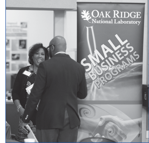
Oak Ridge National Labratory attracted a lot of businesses throughout the day at the ETBGC.