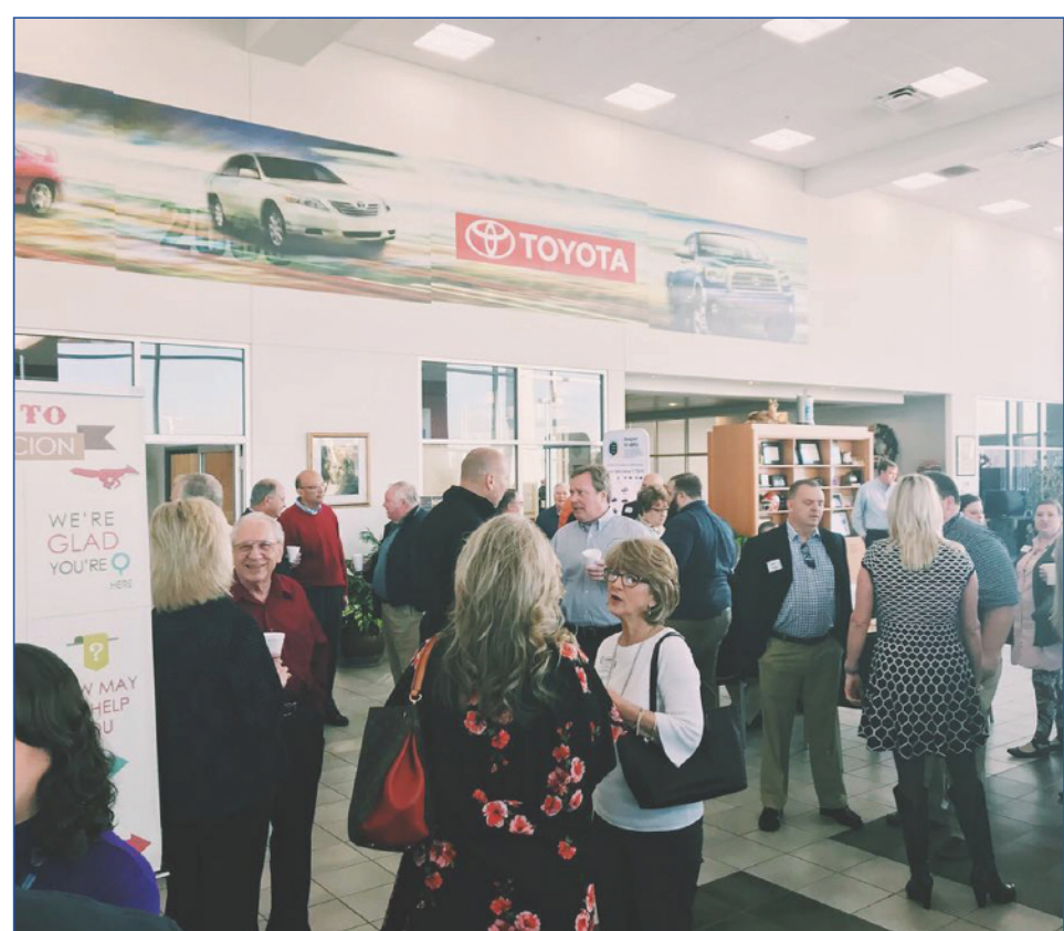
Fox Toyota hosted a Neworking Coffee to a full house on April 5, 2018.