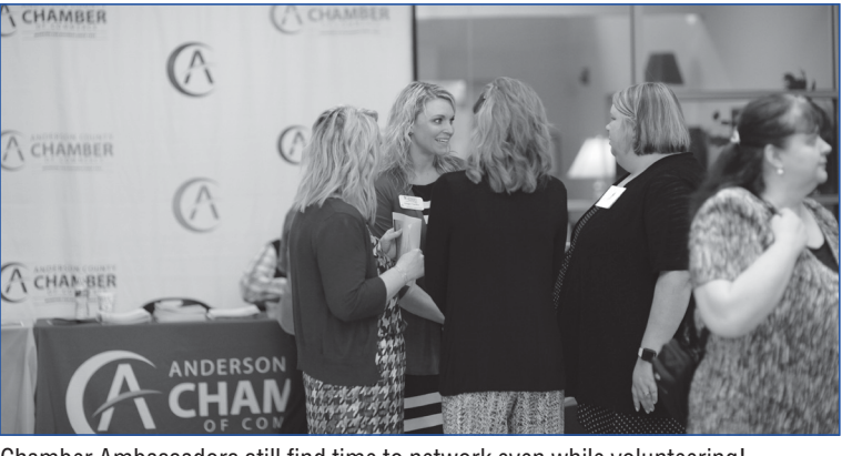
Chamber Ambassadors still find time to network even while volunteering!