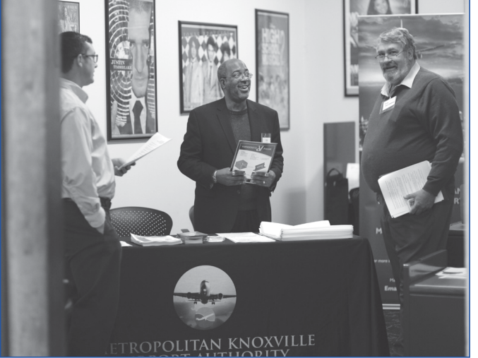
McGhee Tyson Airport was all smiles at the ETBGC.