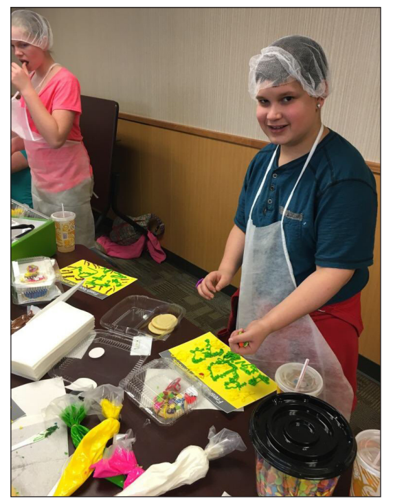
Decorating and sampling treats at Kroger.