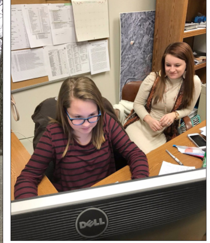
Student job shadowing at Clinton Utilites Board