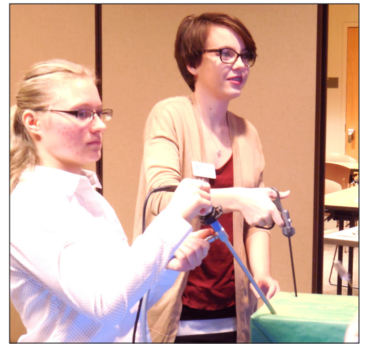
Students learn to maneuver endoscopy equipment and work as a team as one person operates the camera and the other directs the surgeon's controls.