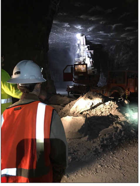
NMS student observing roof bolted in underground mine.

The assistance of parents, community leaders, Anderson County Chamber of Commerce and other industry partners