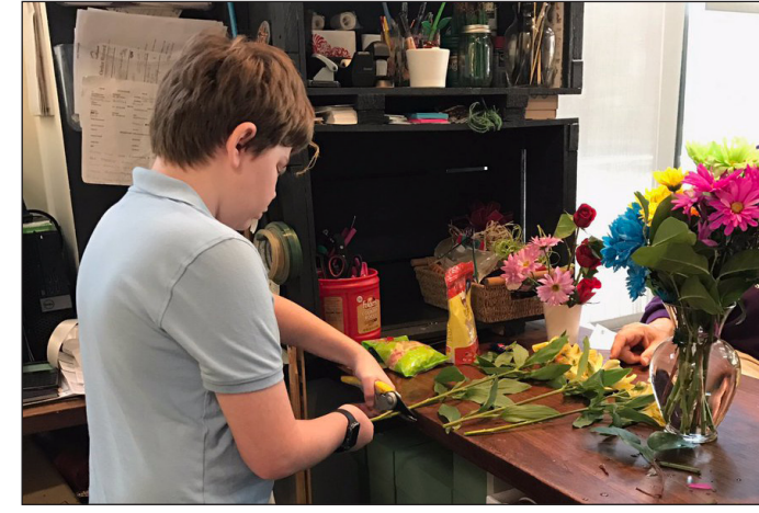
CMS Student hard at work at The Bloomers Company in Knoxville