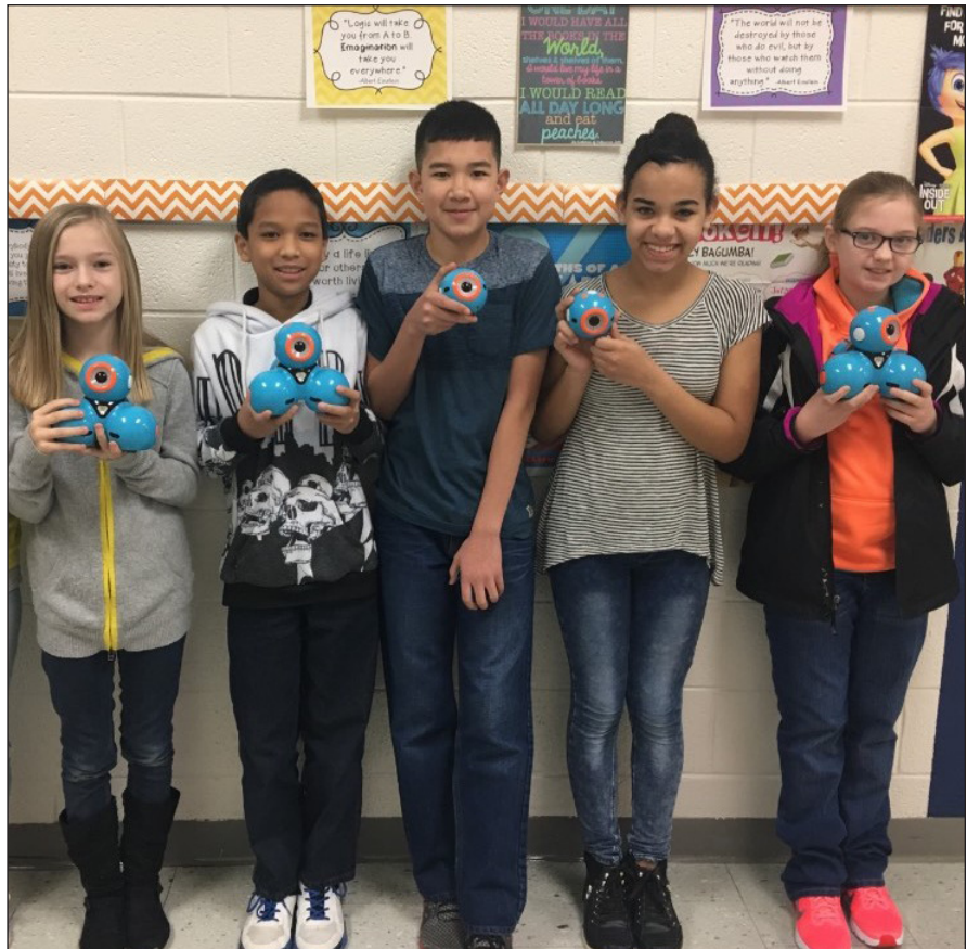
North Clinton students show off their Dot and Dash robots.

the borders! This enrichment activity allows students to problem solve and develop critical thinking skills while learning the basic concepts of computer coding. Students experience such a sense of accomplishment when they successfully "code" their robot to maneuver the LEGO Bricks path with success. A great amount of learning is taking place while having a tremendous amount of fun! It is amazing to see what young minds can create and how they can implement vast problem solving skills when given the opportunity. Clinton City Schools has three sets of Dot and Dash, so computer coding will be seen in all three schools!