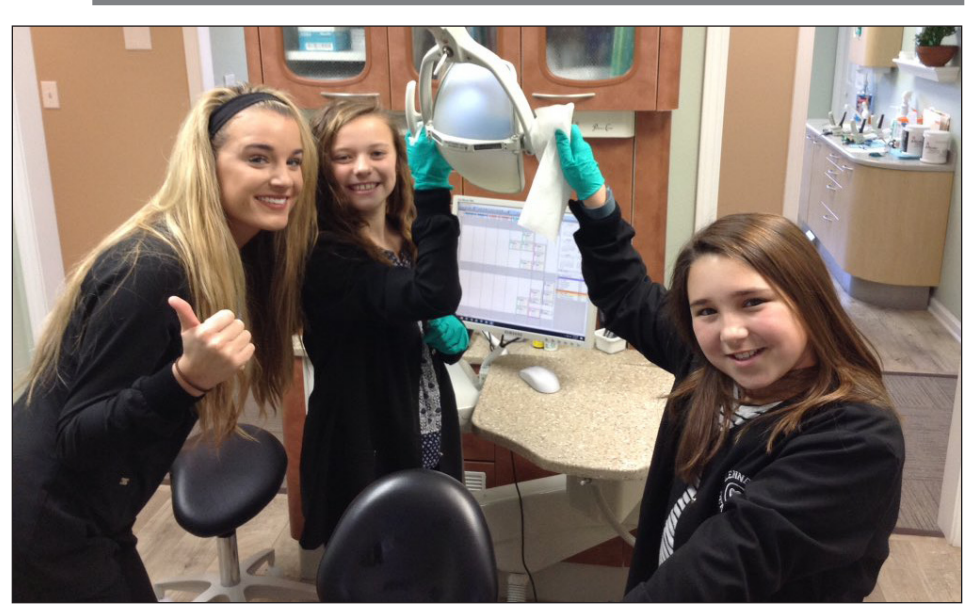
Andersonville Elementary Students at Kennedy Dentistry.