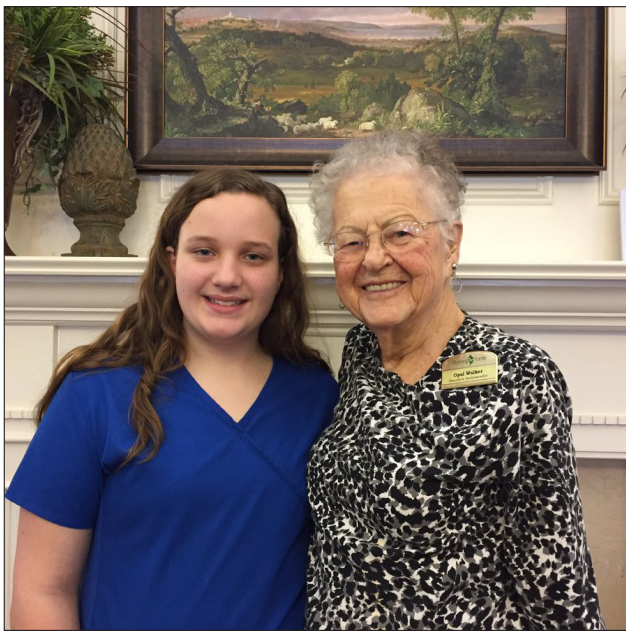
Norris Middle School student helps at Morning Pointe Assisted Living