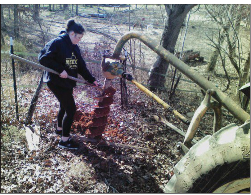
LCMS student building a fence - a farmer's job is never done!