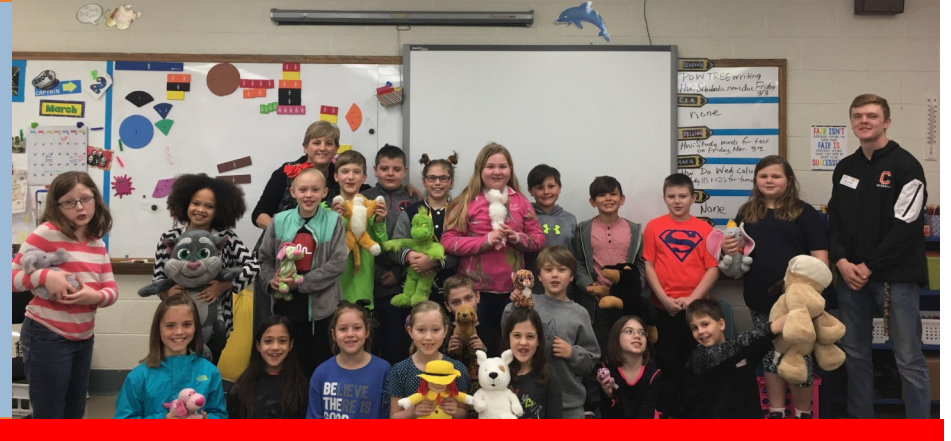
Volume 2, Issue 4