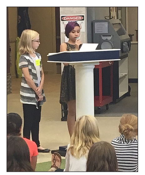
Students from Norwood Elementary open Biztown for the day with a short speech by the student mayor.