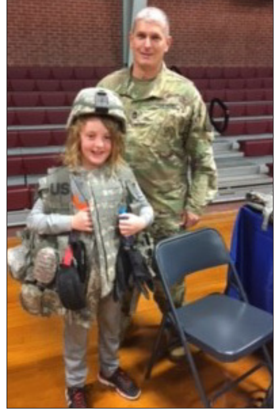
A NWES student tries out the equipment a solider must carry.

Students were also invited to spend a day at Roane State Community College in Harriman. A glimse was provided as to what the college community looks like on a day to day basis. Time was spent in the Biology lab studying human bones and organs! The students thoroughly enjoyed the music lab, where the professor taught them about