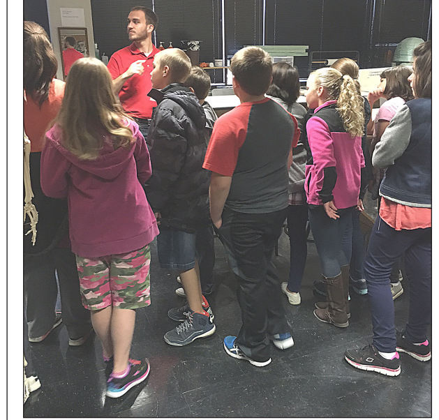
NWES students get a glimpse of college life at RSCC.

All middle school students and teachers across Anderson County have started 2017 with their brand-new Chromebooks. We can't wait to see the wonderful things the kids can do with technology at their fingertips!