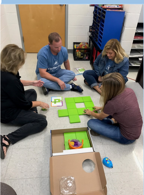
CCS K-2 teachers learning how to code robots on in-service day. One teachers stated, "We actually get paid to do this!"

It's time for the Fall Fire Department Cook-outs! CES & SCES had a great lunch! NCES' cookout will be on October 24. Anyone is welcome to come!