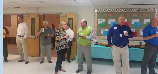
CCS hosted a AC Chamber Networking Coffee! Tours of the school were given to many community members! Thanks to all who came to support our schools!